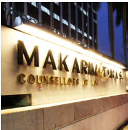
• M&T Updates

If the nominal value of a Rupiah transfer to an account held by a foreign party generated from a transaction other than a Derivative Foreign Exchange against Rupiah Transaction is more than USD1,000,000, the recipient bank must ensure that the foreign party has an underlying transaction.