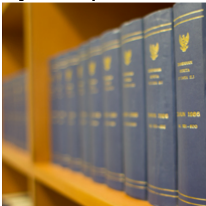
• Legal Updates